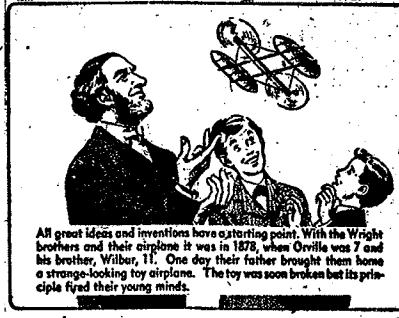
All great ideas and inventions have a starting point. With the Wright brothers and their airplane it was in 1878, when Orville was 7 and his brother, Wilbur, 11. One day their father brought them home a strange-looking toy airplane. The toy was soon broken but its principle fired their young minds.