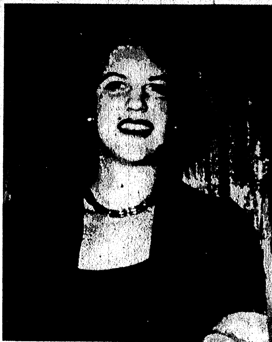
MISSING STUDENT, Sylvia Plath, 20, found in cellar of her home and taken to hospital.