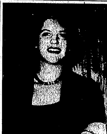
MISSING STUDENT , Sylvia Plath, 20, found in cellar of her home and taken to hospital.